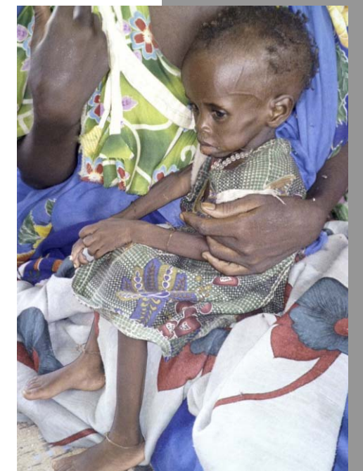
<sup>F</sup> The term, global acute malnutrition or GAM, is sometimes used. . . . It includes both acute malnutrition and severe malnutrition.

Weight and height are used to assess malnutrition in both individuals and populations. Acute malnutrition rates in children six to fifty-nine months of age are used as an indicator of nutritional status of the target population. Survey data should be collected from a representative, cross-sectional population sample of households with children six to fifty-nine months of age. If a child's age is unknown, the cut-off for inclusion in the survey is a height of 110 cm. Training and supervision is needed to ensure accurate and reliable measurements. The weights and heights or lengths of all children in the target age group in the households sampled are measured.<sup>G</sup>