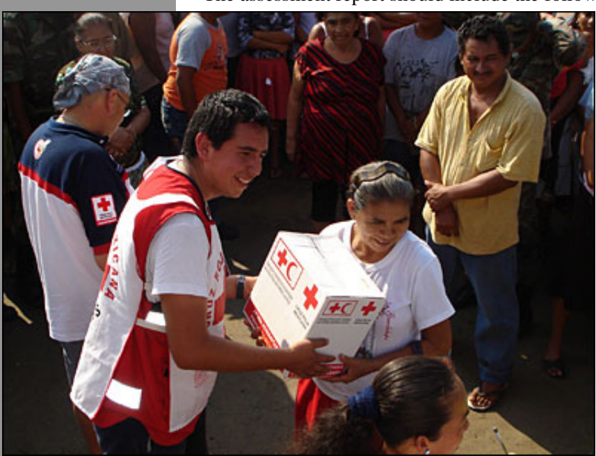
Floods in Mexico - Here, aid for 2,000 families had to be flown in. Air lifts like this one have helped sustain nearly 300,000 people with food parcels.

The assessment report should include the following: